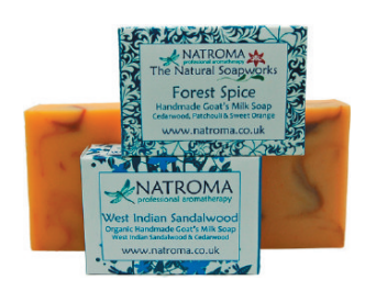
Natroma Goat's Milk Soaps, from £4

Natroma & The Natural Soapworks, Unit 7, Ruskin Glass Centre, Wollaston Road, Stourbridge 01384 399451 info@natroma.co.uk Natroma.co.uk