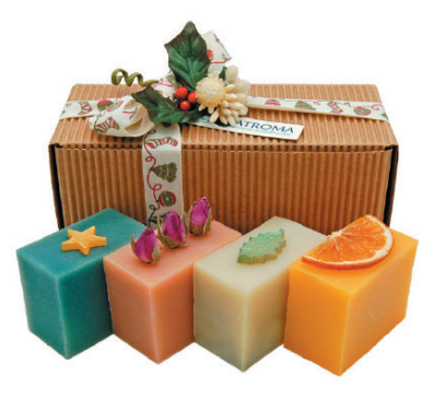
Organic Festive Soap Slice Hamper Artisan aromatherapy soaps, £10