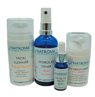
Natroma Organic Facial Skincare Facial Cleanser, £9.95, Organic Hydrolat Toner, £8.95, Q10 Oil Serum, £8.95, Q10 Moisturiser, £18.75